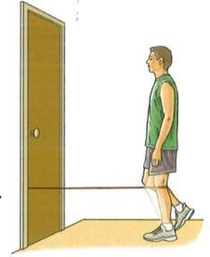
RESISTED TERMINAL KNEE EXTENSION

8. RESISTED TERMINAL KNEE EXTENSION: Make a loop from a piece of elastic tubing by tying a knot in both ends, and closing both knots in a door. Step into the loop so the tubing is around the back of one leg. Lift the other foot off the ground. Hold onto a chair for balance, if needed. Bend the knee on the leg with tubing about 45 degrees. Slowly straighten your leg, keeping your thigh muscle tight as you do this. Do this 10 times. Do 3 sets. An easier way to do this is to perform this exercise while standing on both legs.