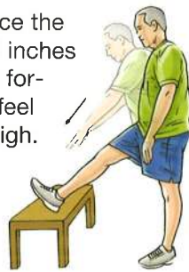
STANDING HAMSTRING STRETCH

1. STANDING HAMSTRING STRETCH: Place the heel of your leg on a stool about 15 inches high. Keep your knee straight. Lean forward, bending at the hips until you feel a mild stretch in the back of your thigh. Make sure you do not roll your shoulders and bend at the waist when doing this or you will stretch your lower back instead. Hold the stretch for 15 to 30 seconds. Repeat 3 times for each leg.