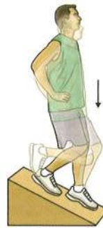
DECLINE ECCENTRIC SQUAT

9. DECLINE ECCENTRIC SQUAT: Stand with both feet on an angled platform or with your heels on a 3 inch high board. Put all your weight on one leg and squat down to a 45 degree angle. Use your other leg to help you return from the squat. When this exercise becomes easy, hold weights in your hands to make the exercise more difficult. Do 3 sets of 10.