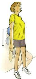
WALL SQUAT WITH A BALL

2. QUADRICEPS STRETCH: Stand an arm's length away from the wall, facing straight ahead. Brace yourself by keeping one hand against the wall. With your other hand, grasp the ankle of the opposite leg and pull your heel toward your buttocks. Don't arch or twist your back. Keep your knees together. Hold this stretch for 15 to 30 seconds. Repeat 3 times on each side.