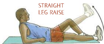
STRAIGHT LEG RAISE

4. STRAIGHT LEG RAISE: Lie on your back with your legs straight out in front of you. Bend one knee and place the foot flat on the floor. Tighten up the top of your thigh muscle on the opposite leg and lift that leg about 8 inches off the floor, keeping the thigh muscle tight throughout. Slowly lower your leg back down to the floor. Do 3 sets of 10 on each side.